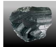
Figure 1: Columbite (\text{Fe,Mn})\text{Nb}_2\text{O}_6 http://thefestresureskaiaai.com

Niobium and Tantalum are lithophile elements, occurring with rare earth elements in granites and pegmatites, and enriched in carbonatites. They reflect a late stage fractionation of pegmatites and carbonatites thus occurring with other unusual resistate minerals. They may also occur in late hydrothermal veins in alkalic complexes. Nb and Ta form stable complexes with F, explaining mobility into these late stage phases. Tantalum occurs ubiquitously with Nb, in a solid solution Nb-Ta series, with Nb usually dominating by 10:1, depending upon source rock. Nb may be enriched in bauxites developed from alkali rocks. Both Nb & Ta are useful pathfinder elements for carbonatites and kimberlites. They are mined from placer deposits, alkali occurrences and carbonatites.