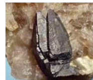
Figure 3: Fergusonite (\text{REE-NbO}_4) http://www.commonswikimedia.org

Columbite is a heavy resistate mineral in the orthorhombic crystal system. It is black, sub-metallic with prismatic or tabular habit, strong cleavage, streak dark red-black, specific gravity of 4-7. Pyrochlore is a vitreous to sooty black-brown heavy mineral (SG 5), isometric structure, with light brown streak, sub-conchoidal fracture. Fergusonite is a REE bearing tetragonal crystal of sub-metallic luster, variable color grey-brown, poor cleavage, sub-conchoidal fracture, density of 5.5-6.