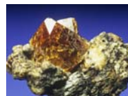
Figure 2: Pyrochlore (\text{Ca,Na})_2(\text{Nb,Ta})\text{O}_6(\text{O,OH,F}) http://www.goldposters.com/